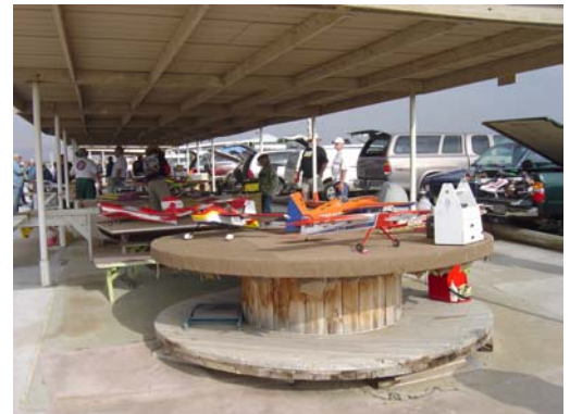
The Gilman Springs Pits