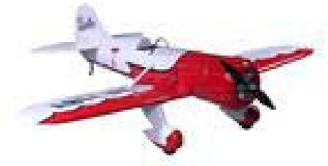
Maxford USA's Gee Bee