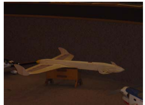
Jack Vail's new scratch built Canard—Very nice!