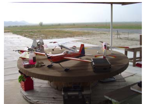
A selection of the our clubs air-planes that flew