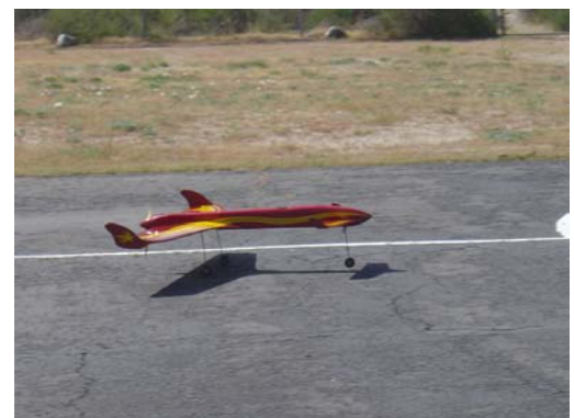
Jack Vail's new creation taxi's out for it's maiden flight