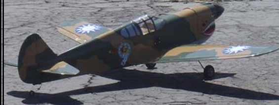
Glen Kratz's Great Planes P-40