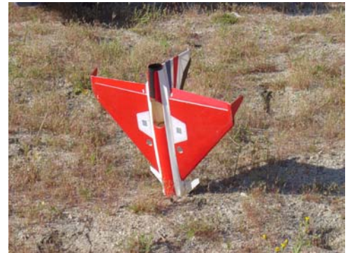
The Mirage survives yet another mishap