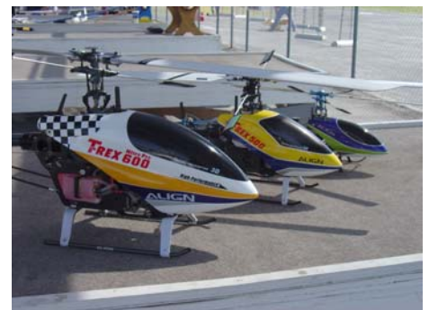
Greg's fleet of Heli's A T-rex 600 nitro, The New T-rex 500 and his T-rex 450