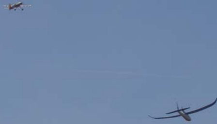
A contrast in Speeds and Size— Mark's Cap and Gerry's easy star