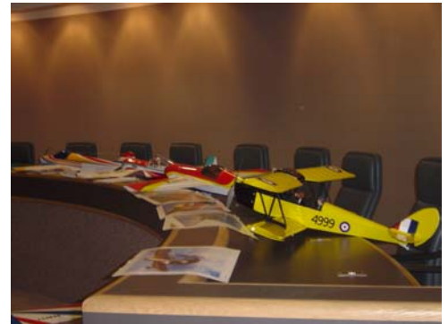
A sample of the Show and Tell