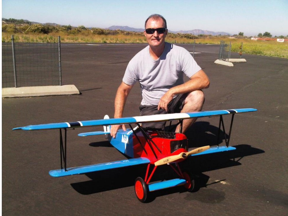
Silvio's Hangar 9 Fokker D7, equipped with Saito 82, five servos, 645 metal geared (hitech). Retailed for approximately $260. 14x6 propeller. Has remote glow system. Flight pack is six volts, 2200 MAH.